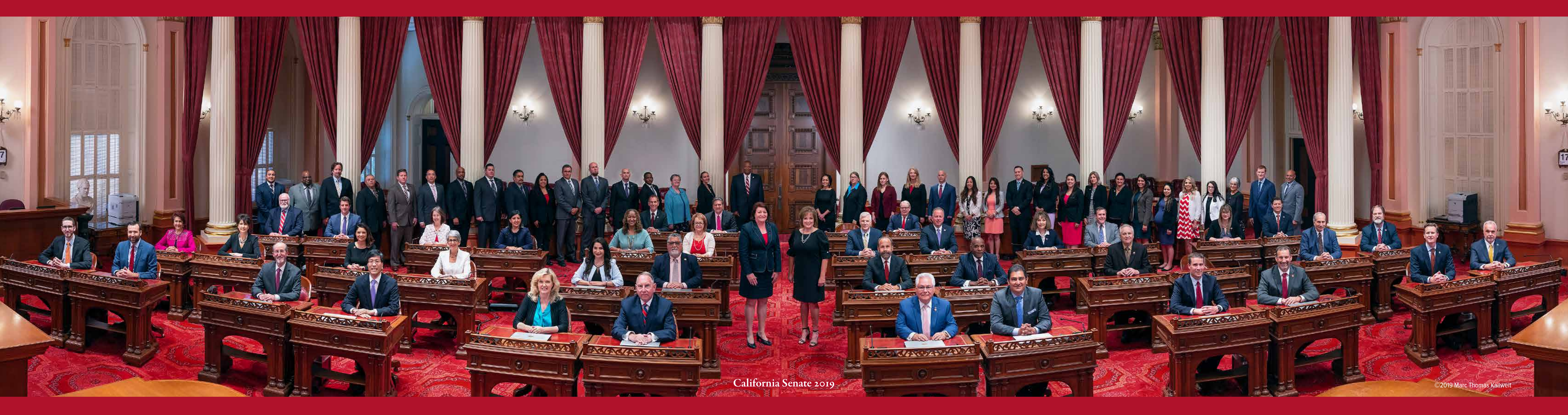
California Senate 2019